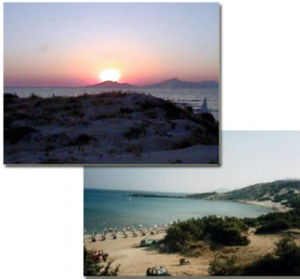
icons from Lambi beach (Kos)

it came back in daylight after the unique systematic excavation in that region on Italian lordship.