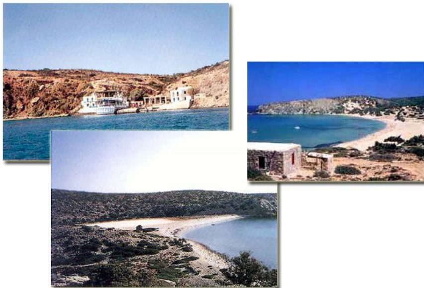
icons from Gavdos bay

The captain decided to keep down the sails, in order to decelerate the boat, leaving it's course in the "chance", and that was nothing else but the providence of God, something that is also testified by the text of Acts (Acts 27, 21-26), after ap. Paul himself appeases the crew, certifying them for their sure salvation, according to a vision that he had.