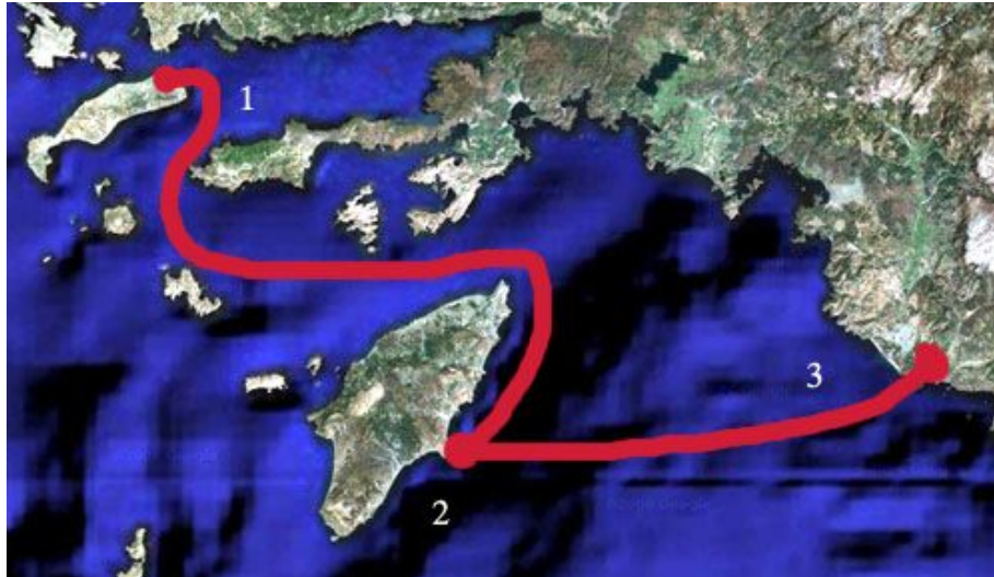
The course (according to Acts) in ap. Paul's third apostolic tour 1. Kos, 2. Rhodes (Lindos), 3. Patara